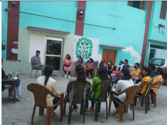
Students as intern in ASMITA