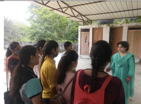
Students as intern in FIX MY LIFE